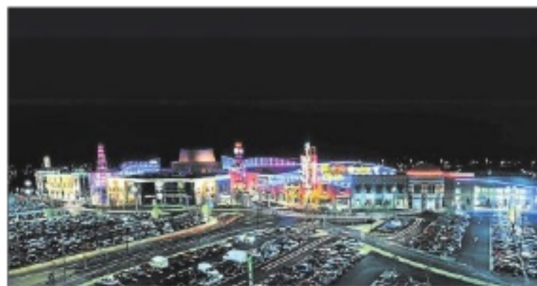
Star City, Birmingham, one of SPV Group's high-profile projects

SPV Group operates a UK-wide service for the refurbishment and maintenance of buildings in the commercial and industrial sectors. It offers services in flat roofing, cladding, rainscreen, fascias, glazing, curtain walling, slating, tiling, gutter maintenance and road carpet.